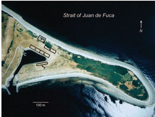
FIGURE 1. Sample Plots (A–E) located in the gull colony on Violet Point, Protection Island. The larger colony extends throughout most of western half of the spit in lightly-shaded areas east, north, and south of the marina.

until the fate of each egg was recorded as cannibalized, eagle depredated (see below), addled, died during pipping, hatched, or other (punctured, nest flooded, or rolled out of nest). For each nest, we determined the distance from its center to the center of the nest of its “nearest neighbor” (Patterson 1965) using a tape measure or laser rule (2006–2010), or a Trimble GPS and ArcGIS Desktop 10 with the “pointdistances” tool in Geospatial Modeling Environment software (2011). We also recorded the habitat type, each of which was readily distinguishable from all others: short or sparse vegetation (non-vegetated substrate or vegetated substrate without American dune grass, Leymus mollis , or gumweed, Grindelia integrifolia ); by a shrub (most commonly gumweed) or a log but not on the beach; beach (cobble and/or log-strewn area from water to base of the short ~0.5-m-high bluff bordering the beach); and beside or in tall grass (American dune grass). In 2007–2011 the mass of each egg was measured on the day it was laid using a 400-g capacity Ohaus Scout Pro SP401 portable electronic balance.